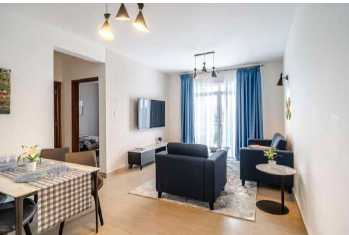
2BHK Dining and Living Area