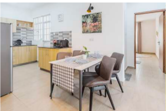
2BHK Dining Area and Kitchen