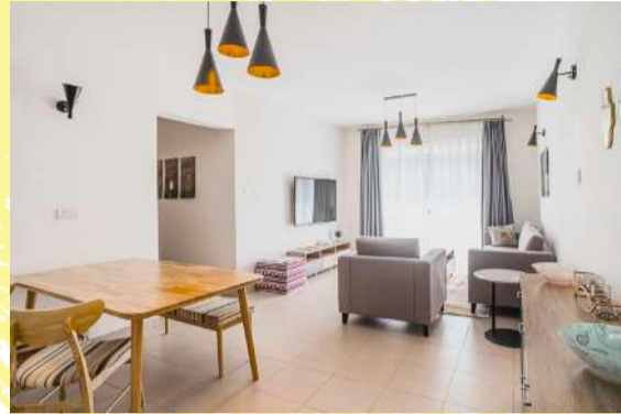
3BHK Dining and Living Area