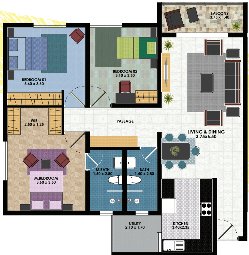
3BHK Floor Plan - 112 SQM