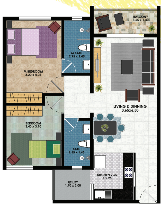
2BHK Floor Plan (Type A) - 85 SQM