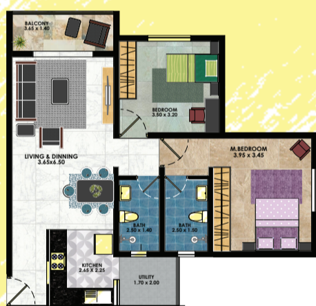
2BHK Floor Plan (Type B) - 85 SQM