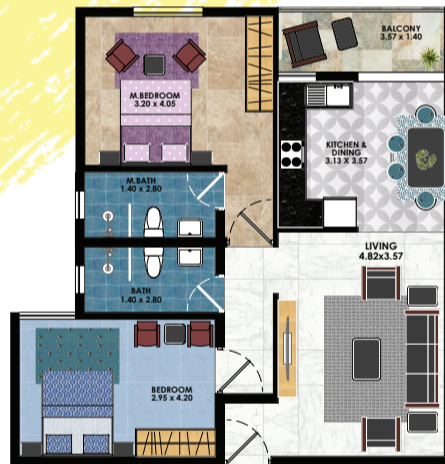
2BHK Floor Plan (Type C) - 82 SQM