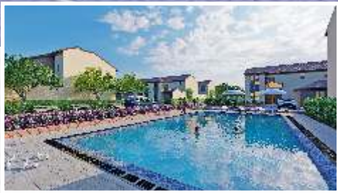
▲ Swimming Pool